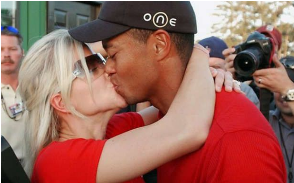
A Hollywood kiss

So why was Elin chosen? Hold onto your hat. It may be because she is a twin. She has a twin sister, Josephin. When the Parneviks brought Elin to the US to be their nanny, they brought Josephin as well. We have seen in many previous papers that Intel loves twins.