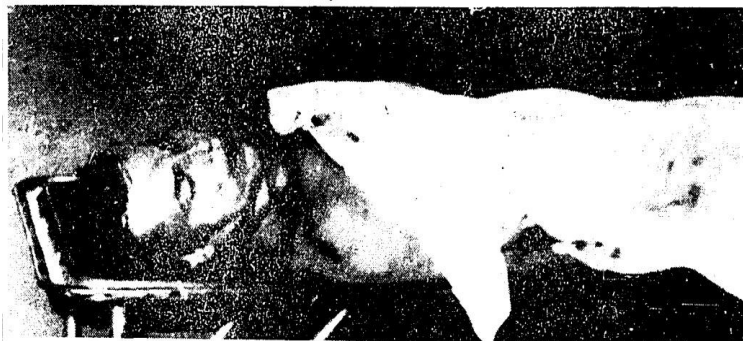
Body identified as that of US Rep. Leo Ryan lies on stretcher in Georgetown morgue after autopsy.

In 1972 Davis received an honorary doctorate from Moscow University. This was simply to keep the embers hot. I trust you see the point of all this? It was again to spoil race relations and throw a wrench into the integration of the time. The government could have been promoting real black leaders, but instead it was promoting their own fake leaders like Davis. They purposely made her as unappealing to your average white citizen as possible. They made her a Communist, a loudmouth, a criminal, and a friend of the Russians. They photographed her smoking pot in public, which was of course illegal. Her involvement in the Jonestown hoax was also intended to make you hate her. She was like the black Jane Fonda, saying and doing everything wrong on purpose. I was brought up in a liberal household and still consider myself liberal, but I disliked Fonda from the beginning. As it turns out, I was supposed to. She was an Anti, playing her part. So was Davis.