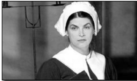
Kirstie Alley as Ann Putnam