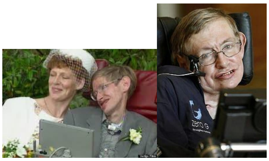
dated 1995 but actually ~1984