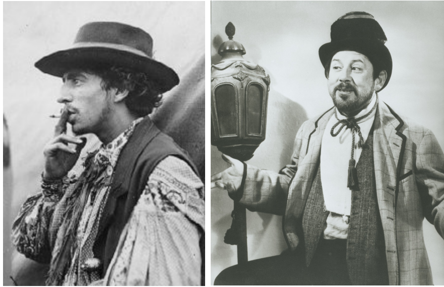
both Ewan MacColl?