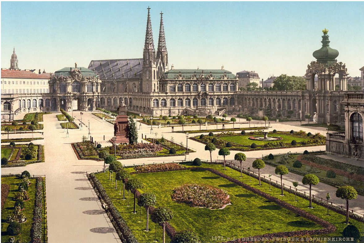
That is the Zwinger Palace in Dresden in 1900.