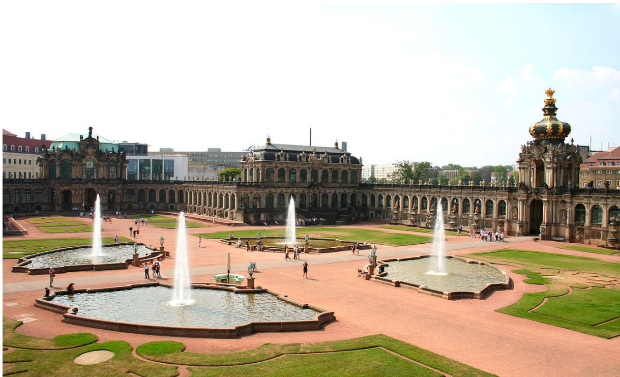
That is the Zwinger Palace now. We are told it was mostly destroyed in 1945. I find that hard to believe, since architecture like that is now impossible. It can't be done or redone. Why? Because of the incredible stonemasonry involved. Carvers like that don't exist anymore.