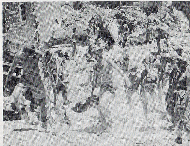
Clearing the debris of the King David Hotel bombing in search of the 101 innocent victims of all creeds.