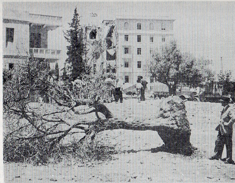
Zionist bombing of the Mandatory Government H.Q. in the King David Hotel in Jerusalem, on the 22nd of July, 1946.