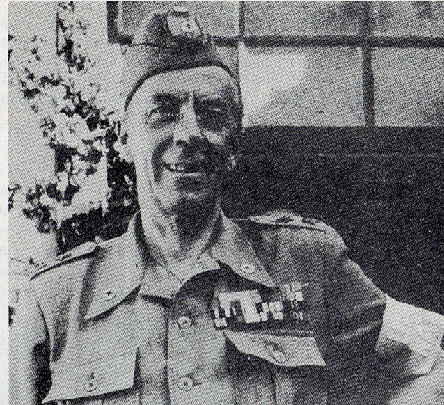
COUNT FOLKE BERNADOTTE

"The Jewish State was not born in peace as was hoped for in the resolution of November 29, 1947, but rather in violence and bloodshed."