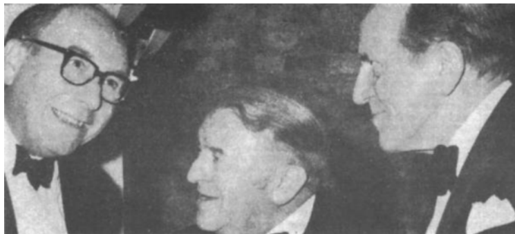
Gentle Home Secretary Roy Jenkins gets his latest set of instructions from Lord Fisher and Maurice Orbach.

The British Nation is bedevilled today by alien organisations that have established themselves within our Christian Nation and aim to take us over, to destroy our Christian culture and force us to follow their preconceived designs. Unfortunately they have infiltrated themselves into our educational and religious systems and have educated many adepts among our people who unknowingly carry out their will. Many of them have been advanced to high places.